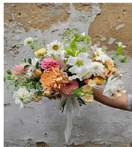
Large 'pastel' bouquet July