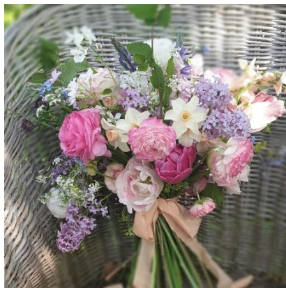
Regular 'pastel' bouquet May