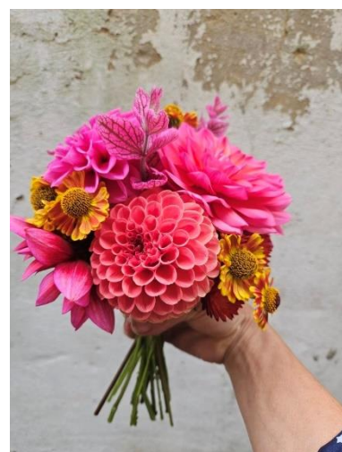
'Bright's wedding bouquet petite size

If you would like me to use the seasonal flowers that I grow here to create your bouquets, buttonholes or jam jar style posies for your tables, as a part curated option, then my prices are as below. I can also create floral headbands, floral collars for your pouches, pew ends and any other type of floral arrangement you might require. Please enquire for these prices.