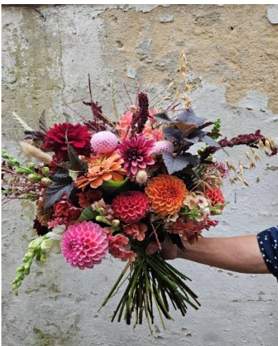
Extra large 'Autumnal' bouquet September £175