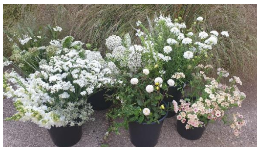
'Whites and Cream'