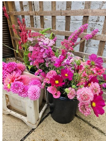
'All the Pinks'